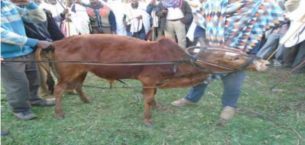
Fig 4: Korma Fuuloo slaughtering ceremony