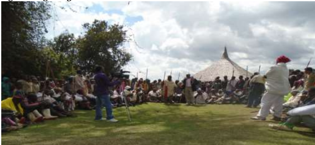
Fig 2: The get-together of Raabaa ritual

Raabaa's process has various sequential and remarkable steps. According to data gathered from FGDs the basic step to practice Raabaa ritual is the discussion and decision among Abba Bokku , Abba hookka and saddetta about setting of Raabaa and what ought to be or not. Even though it is not obligation, others would also participate and share their ideas and details. To sum up, discussing and deciding about how, when, where, who, whom, and what should be taken on the upcoming Raabaa by front runners and/or leaders is a typical and considerable fundamental stage in the Raabaa processes.