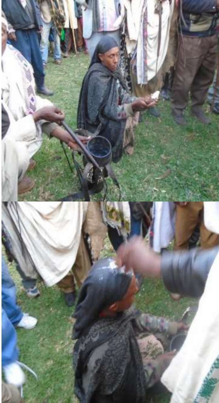
Fig 7: Women participation and their roles