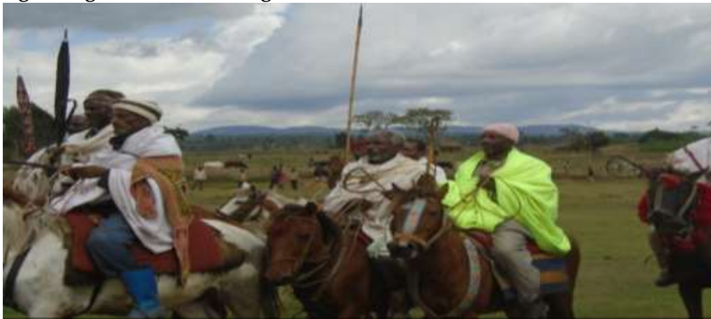
Fig 3: Gugsii Raabaa (Riding Horse at Raabaa ritual)

Source: Photograph, taken by researchers, February 05, Dodolaa.