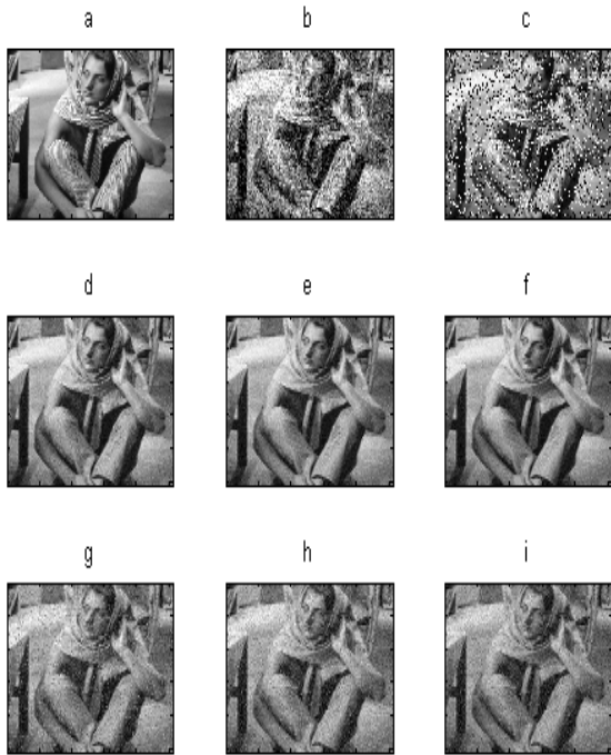
Fig.4. Results in denoising of 'Barbara' image

The images is corrupted by Gaussian noise (Fig. 3, 4-b) salt and pepper noise (Fig. 3, 4-c).