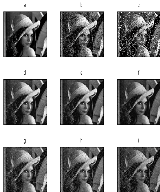
Fig.3. Results in denoising of 'Lena' image

Next figures illustrate an example of removing additive noise.