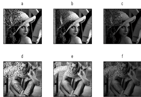
Fig.5. Enhancement of images in which the noise represents a stain: Lena above, Barbara below

The results are presented in Fig. 5-b, e, and that are compared with images enhanced through universal threshold method Fig. 5-c,f.