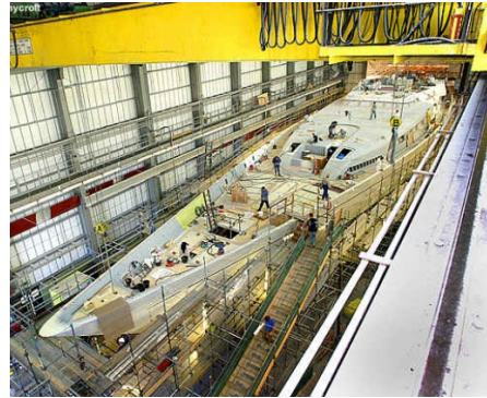
Fig.5. Mirabella V