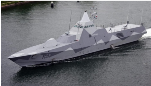
Fig.1. Visby Class Swedish Corvette

tensive use of composite materials can be seen in the Swedish Royal Navy's Visby class, measuring 72 meters in length and 10,4 meters in width (Figure 1). This ship is the largest military ship built using composite materials (carbon fiber in the sandwich structure with vinyl ester resin matrix). If Visby was to be made of traditional metallic materials, the total mass would have been almost double (1,200 tons), making composite material largely responsible for the performance of the corvette.