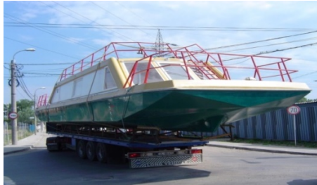
Fig.3. Cargo boat built in Galati

steel, in the case of Mirabella V (Figure 4) the material of choice was composite due to the speed of construction, the low maintenance of the hull surface and the good acoustic and thermal insulation offered.