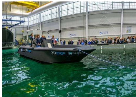
Fig.6. 3d printed composite boat [9]

One of the advantages of composite materials is that certain features specifically sought by the designer can be modified by relatively easy-to-operate changes in the way the final laminate is obtained.