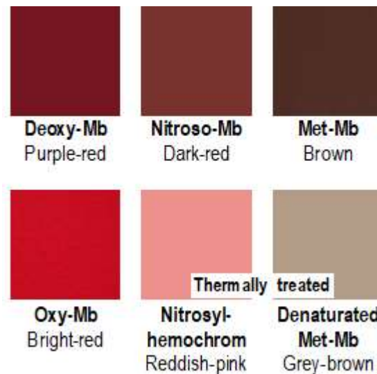
Figure 1. Visual effect* of different state of myoglobin (Mb). *Colored online

products is the result of highly complex chemical processes, culminating in the formation of nitrosomyoglobin (Figure 1).