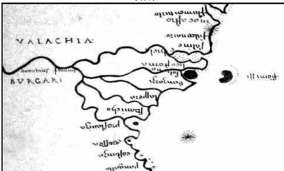
Fig. 3. A fragment of the map of Black sea MARE PONTICUM SIVE PONTUS EVXINVS. Genoa, XVI century.