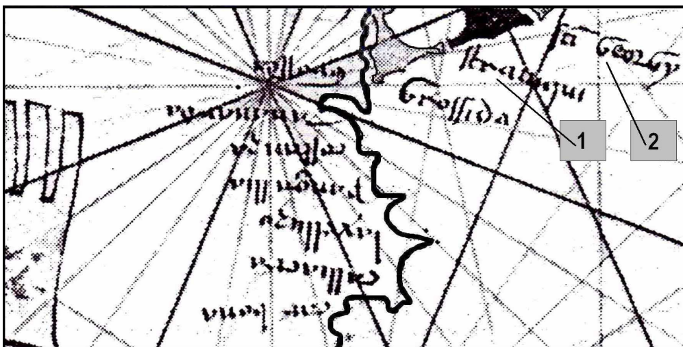
Fig. 1. A fragment of the Venetian map of Black Sea, 1321. 1 – Straniqui ; 2 – Sn Georgy