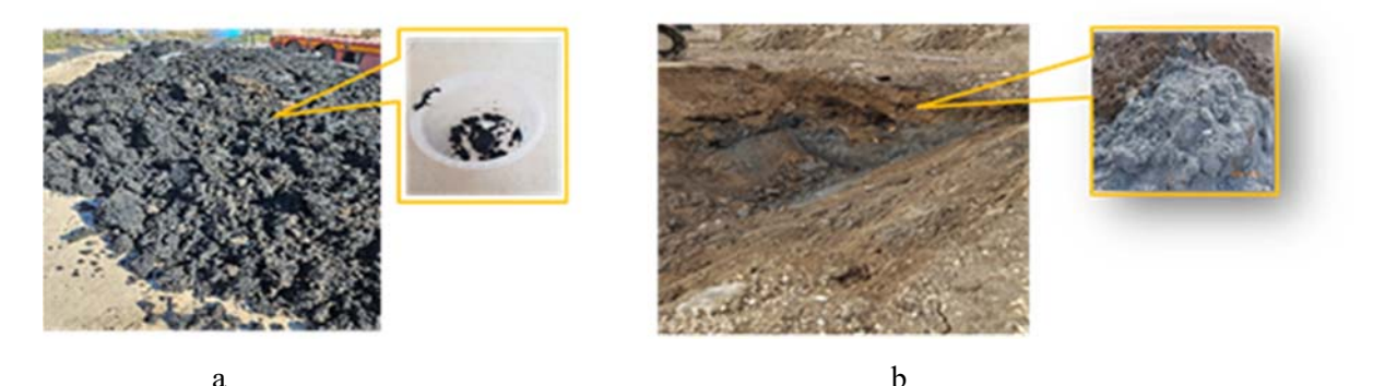
Fig. 1. The sewage sludge and soil samples used in this study a - dehydrated sewage sludge; b - old contamination of soil with petroleum products

Sampling. The dehydrated sludge sample was taken from a municipal sewage treatment plant (Galați County, Romania), and the soil sample contaminated with petroleum hydrocarbons was taken from an old former petroleum product storage (Constanța County, Romania, Fig. 1). The sewage sludge and soil mixture was made by mixing the two samples in equal proportions (1:1 v/v). The samples were collected in a sterilized glass jar using a sterilized ceramic spatula. The samples were transported at 4^{\circ} C to the laboratory for further analysis.