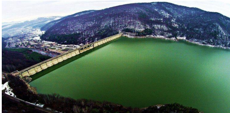
Fig. 1. Poiana Uzului Lake

granular activated carbon) [4]. This study aims at finding out the environmental impact of water treatment process regarding the energy consumption.