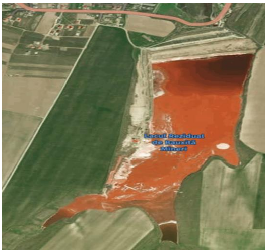
Fig. 1. Residual bauxite lake "Minerii"- Tulcea

We used soil samples taken from the area of the residual bauxite lake Minerii in Tulcea, as well as adjacent soil samples from the agricultural area to determine the pH and the chemical composition.