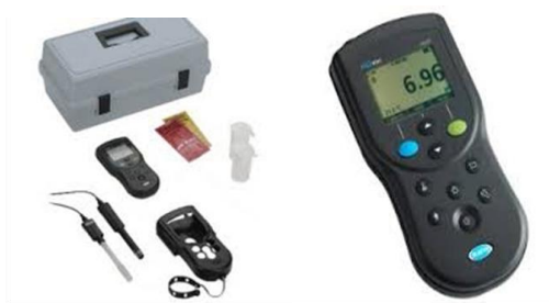
Fig. 2. Multi-parameter HQ40d

In the laboratory of the faculty, the pH was determined for the soil samples taken from the lake and the agricultural area in the lake using a HQ40d type multi-parameter (Fig. 2)