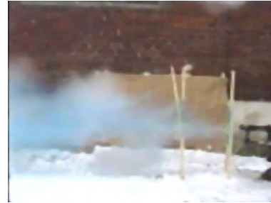
Shooting 1 Image water jet after 80 ms