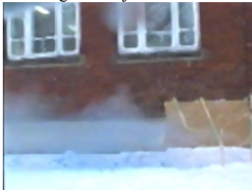
Shooting 5 Image water jet after 40 ms