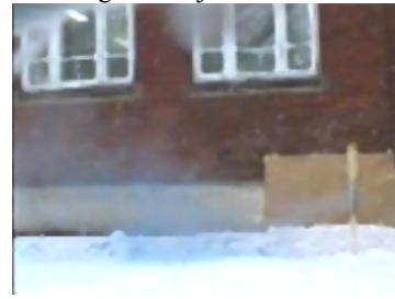
Shooting 4 Image water jet after 80 ms