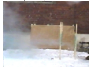
Shooting 1 Image water jet after 160 ms