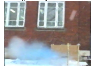
Shooting 6 Image water jet after 40 ms