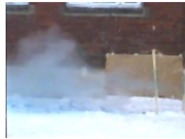
Shooting 3 Image water jet after 80 ms