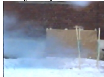
Shooting 2 Image water jet after 80 ms