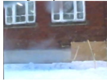
Shooting 5 Image water jet after 80 ms