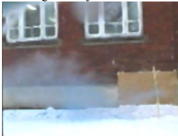
Shooting 4 Image water jet after 40 ms