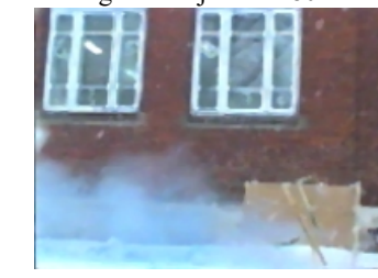
Shooting 7 Image water jet after 80 ms