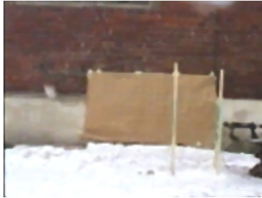
Shooting 1 Image water jet after 40 ms

noise level. Pictures of the geometrical configuration of the water jet propelled by the disruptor during shooting, for first shooting, are presented in Figure 2.