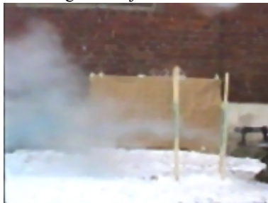
Shooting 1 Image water jet after 120 ms