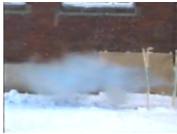
Shooting 3 Image water jet after 40 ms