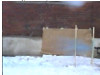
Shooting 2 Image water jet after 40 ms