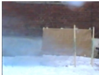
Shooting 2 Image water jet after 120 ms