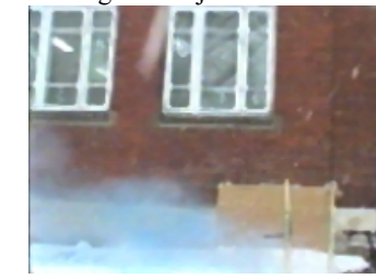
Shooting 6 Image water jet after 80 ms