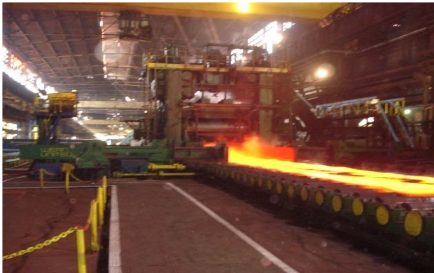
Fig. 1. View of L.T.G.-2[1]