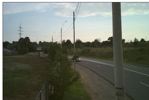
Fig. 4. Video testing on Braila-Galati dam

In Figures 3 and 4 are video images taken from the Braila-Galati dam area, high resolution images that can show aspects needed for experimental research.