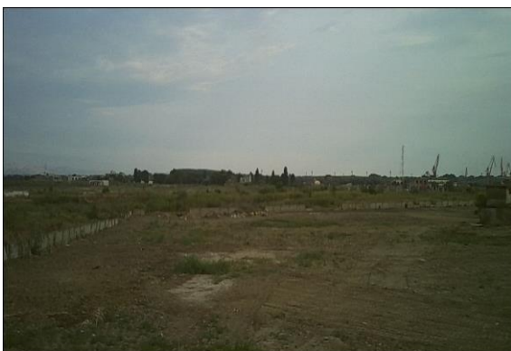
Fig. 3. Video testing on Braila-Galati dam

In the study of the monitoring of environmental parameters we used the drone together with a variety of sensors placed on different areas of the drone, which can perform a variety of monitoring tasks.