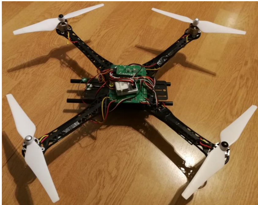
Fig. 2. Drone frame