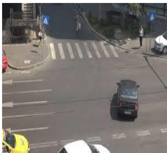
Fig. 6. Determination of traffic noxious