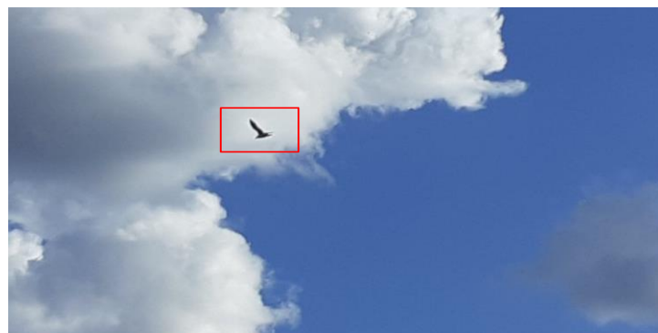
Fig. 5. Detection of bird