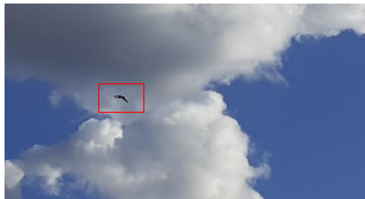
Fig. 4. Detection of bird