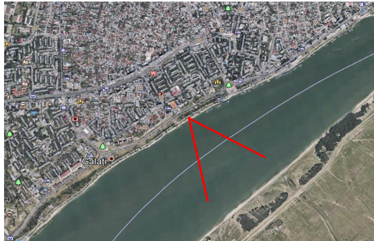
Fig. 3. Cameras Field of View

The neuronal networks analysis is able to classify the objects and exclude those that are not birds. The birds are marked with a rectangle (Fig. 4 and 6), regardless of the wing positions.