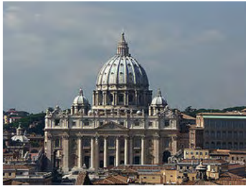
Fig 16 The Holy Peter basilica- general view.

the second church was built by his son, Constantine and by the emperor Theodosius the Great.