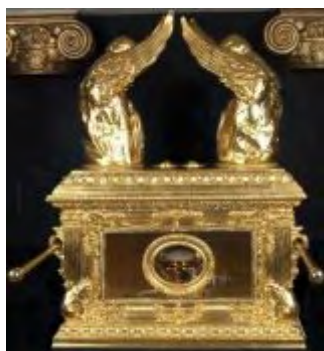
Fig 8. The Law Shrine (from the Capernaum synagogue IV-III century before Christ).

During the exodus, the tent was a holy place for the Hebrew people (Exodus 33, 11). Its appearance and dimensions are mentioned in detail where Yahweh advises Moses to built it (Exodus 26) and where its building by the two skillful masters, Betaleel and Oboliah, is described (Exodus 36, 8-38). The most important objects are the altar of incensing, the candelabrum with seven arms (Menorah), the table for offerings, the Ark of the Covenant, the copper snake etc.