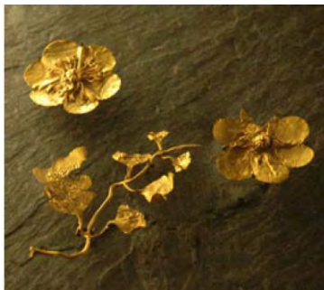
Fig. 4. The funerary diadem Kept in the Louver Museum.

The European territory, rich in natural resources, is characterized by the presence of many treasures made of precious metals and stones [11-15].