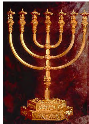
Fig 9. The candelabra with seven arms – Menorah.

The contents of the Ark have been debated through the centuries. The general consensus is that the first tablets containing the Ten Commandments, which were broken by Moses, and the second tablets, which remained intact, were contained in the Ark.