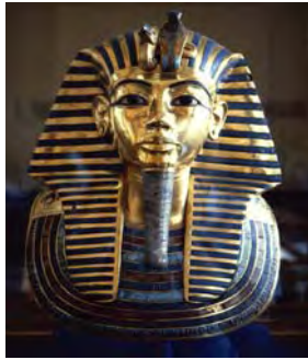
Fig. 2. The Tutankhamen mask.

The gold funerary objects in Ancient Egypt included coffins, altars and funerary masks. One example of gold used in burials is the treasure of the Egyptian Tutankhamen pharaoh, who reigned between 1333 and 1326 B.C.. Tutankhamen's chair, with its golden back, decorated with filigree can be observed in picture 1 and the pharaoh's funerary mask is presented in picture 2.