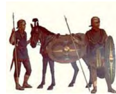
Fig 13. Roman soldiers endowed with fight equipment

The javelin or pilum had a sharp tip followed by a thinner portion, designed to break on impact and leave the tip inside the victim.