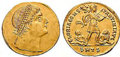
Fig. 17. Gold coins( the solidus) during the Constantine the Great