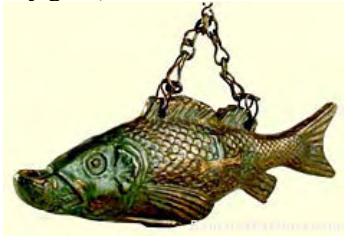
Fig. 14. The fish- Christins symbol.

In the first three centuries of the Christian era Christianity was forbidden and Christians were persecuted because of moral principles which defied the faith in many gods, and the cult for the Empire.