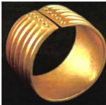
Fig. 7. Muff opened gold bracelet – The treasure is stored in The National History Museum from Bucharest.

Among those jewelry items there were spiral bracelets, ornamental chains obtained by knitting threads and rings, bracelets with Hellenistic snake heads. The Geto-Dacian craftsmen also mastered the gold coating technique. The largest bracelet is an open cuff made of massive gold sheet, weighting 580 grams, decorated with 10 buttons fixed into holes.