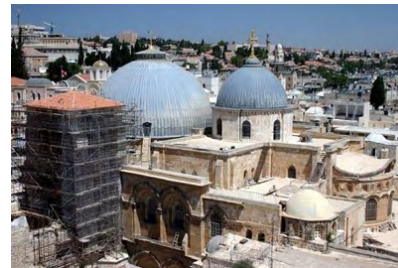
Fig.15. The church of the Holy Thumb (Jerusalem - exterior from the church).

The Church of the Holy Sepulchre (Latin: Sanctum Sepulchrum), also called the Church of the Resurrection (Greek: Ναός της Αναστάσεως, Naos tis Anastaseos; Arabic: كنيسة القيامة, Kanīsat al-Qiyāma) by Eastern Christians, is a Christian church within the walled Old City of Jerusalem.