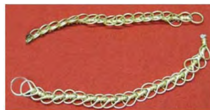
Fig. 6. Gold bracelets.

The Etruscans, the first inhabitants of Italic peninsula, were also interested in jewels. The Kings appeared in the ceremonies as supreme priests, wearing gold crowns, precious footwear, mantles richly embroidered and decorated with human faces, and they sat on a sumptuous thrones during trials and gatherings. During ceremonies dedicated to military victories, the King wore a scarlet toga, embroidered in gold, a golden crown, a sphere and a golden chain, and in the hand an ivory scepter with an eagle at its top.