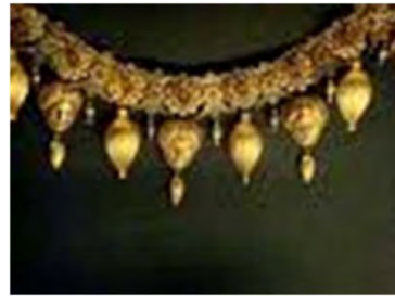
Fig.5. Gold necklace.

Alexander the Great defeated Darius the 3 rd and conquered Babylon, Sosa and Panopolis, the great treasure of Persia was robbed and the riches were carried on 2000 mules and 3000 camels. The metals from this treasure were transformed by the Hellenic Kings into coins (the unique coin of Alexander the Great, made of gold – the stater). The only symbol of royal authority worn by all Hellenistic Kings was the diadem (Fig.4 – the funerary diadem on display in the Louvre Museum ) adopted by Alexander from the Persian kings.