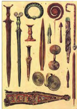
Fig. 3. Guns from Bronze Age, Romania.

The European territory, rich in natural resources, is characterized by the presence of many treasures made of precious metals and stones [11-15].