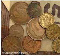
Fig 10. The coins used in the New Testament.

Long before coins were introduced, merchants traded in wares. Anything could be traded, from objects, metal, wood, food or livestock.