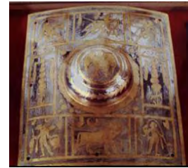
Fig. 12. Roman palladium.

Later, the cohorts increased to twelve. The Praetorian uniform was similar to that of other legions, except for the helmet which was gold coated and had the imperial eagle on it.