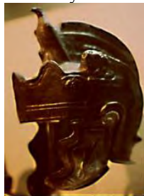
Fig. 11. The golden helmet- has fixed the imperial eagle.

In the year 27 B.C., Augustus instituted new elite troops - the Praetorian Guards – with the exclusive mission to defend the emperor. At the beginning, they were nine cohorts, out of which three stayed in Rome and the others in the nearby cities.