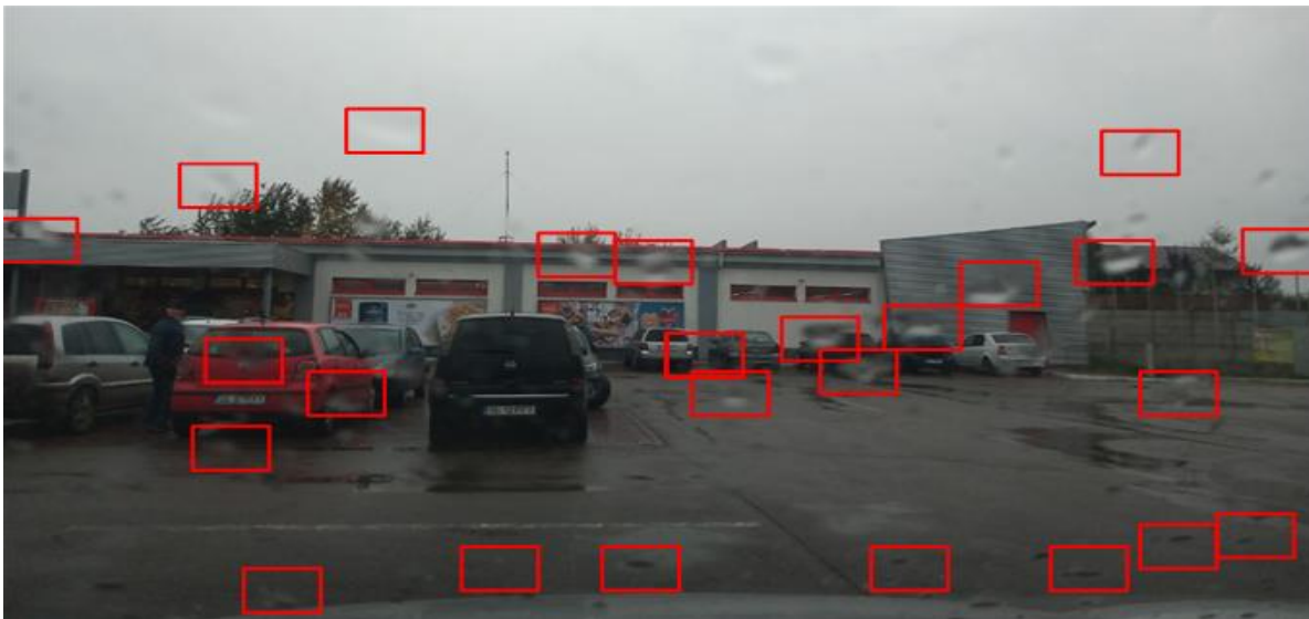
Fig. 4. Face detection and eye opened detection

In case of the accident happened of broken windshield (Fig. 3), the system detected successfully that the image is not accurate in order to be processed. The developed algorithm is detecting most of the raindrops (Fig. 4).