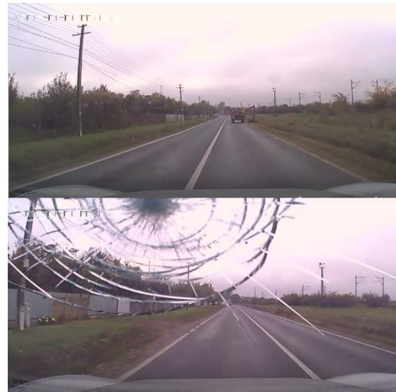
Fig. 3. Broken windshield

processing unit of several algorithm to detect lane, obstacles, pedestrians, etc. will make the issue of computational resources important. The neuronal model should run not every frame, but also when the luminosity is changed to a low level, as most raindrop occurred when low luminosity occur, but also there are exceptions concerning weather conditions. In this respect the design parameters should be carefully tuned. CNNs are very efficient because they reuse a lot of weights transmitted across the network. OpenVino was used with Keras learning data in order to train with our data samples. The generic algorithm is described in Fig. 3. The movement detection filters images where motion is detected to some areas, whereas some areas are static. In such a way not all the images are processed in order to achieve a fast overall algorithm, taking into account that this rain drop detection is an auxiliary feature and not the main feature of a ADAS system. The input image is filtered in order to contrast contours with blurred image. The algorithm is tuned in such a way that in case of more than 20% of covering the windshield the system should run the windshield wipers. This percent should be at driver choice in order to achieve best comfort. CNN layers will identify several layers and will provide confidence score that is providing the detection results.