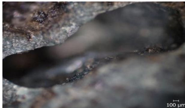
Fig. 6. The image obtained by optical microscopy of a pore that appeared in the lay of ceramic material

Capillary pores in concrete appear due to the loss of excess water through evaporation (Fig. 6).