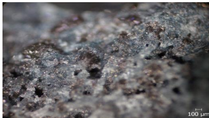
Fig. 2. The appearance of the sample, in the area at the shotcrete -metal interface

For concrete constructions, which are located in environments exposed to wear, and in areas of intense exploitation, obtaining concretes with a low degree of permeability is essential.