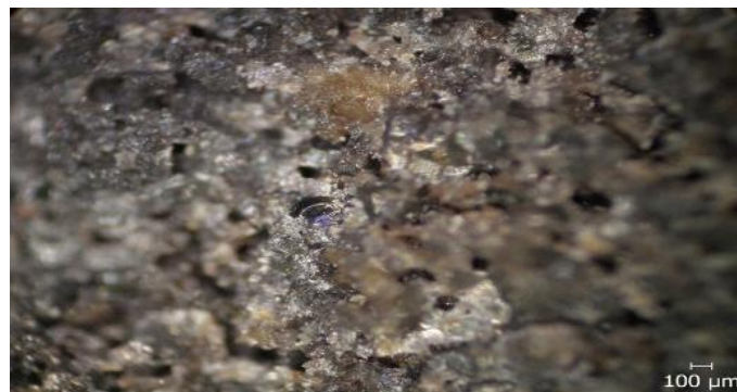
Fig. 4. The appearance of the sample, in the area at the shotcrete-refractory concrete interface