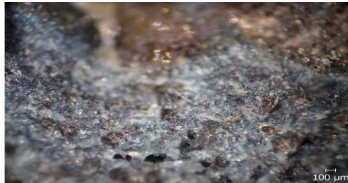
Fig. 5. The appearance of the sample, in the area of the refractory concrete wall