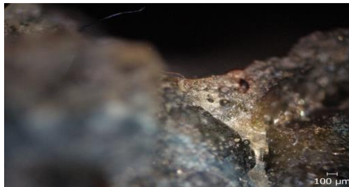
Fig. 3. Penetration of the liquid alloy into the capillaries of the ceramic material