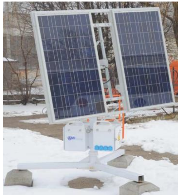
Fig.1. Photovoltaic installation with automatic orientation to sun for electricity supply of hail stations and water pumping [4]

Due to the need to connect the performance of photovoltaic systems for supplying antigrain stations to modern requirements, a photovoltaic system with self-orientation to the sun was developed, assembled and tested at the Technical University of Moldova (Fig. 1) [4].